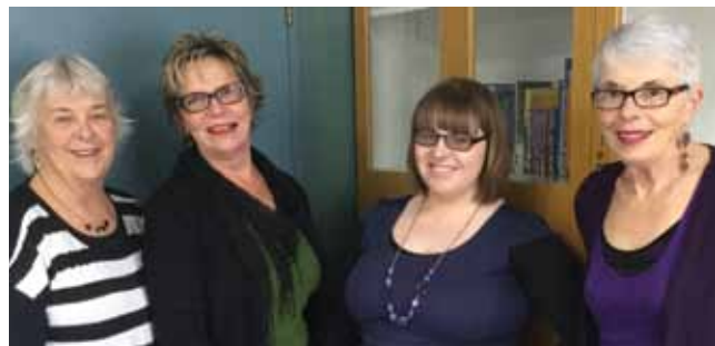
Carol Central Auckland