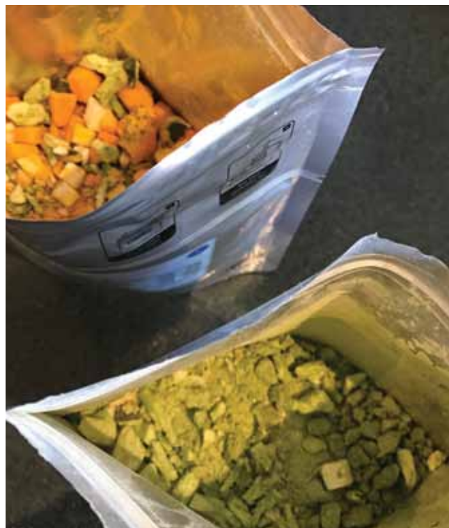
Before adding the water

One pack costs $16 and is a good sized meal for one hungry person. Because we enjoyed it on a Friday evening we also opened a bottle of red wine, making the evening very special. We both loved the meals we had and would certainly look to have more in the pantry for those days when we just don't feel like cooking.