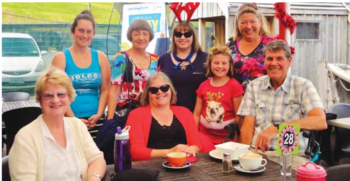
The 'North Café Groupies' Support Group enjoying their end of year Christmas lunch.

We presently have 16 support groups running throughout Auckland and welcome any new members. You will find a full list of current groups on page 20. If you would like more information on any of the groups or are interested in having a Support Group in your area or leading a group, please contact the Field Worker serving your area.